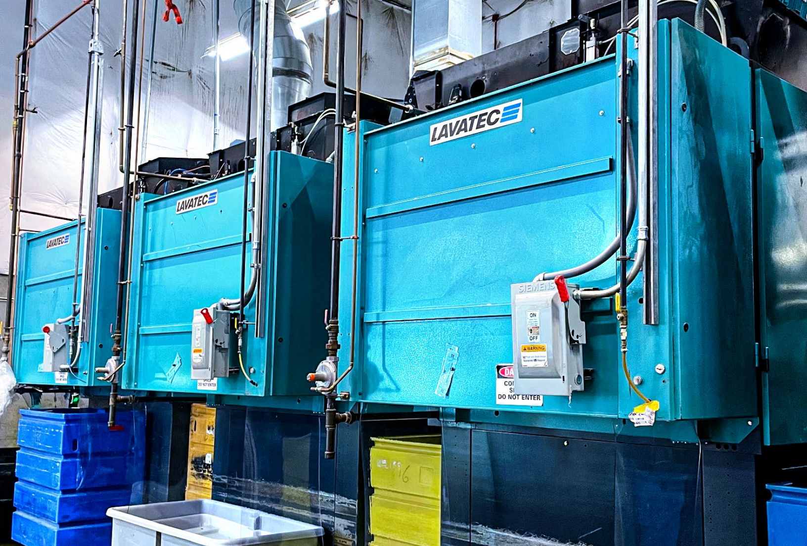
In addition to the tunnel washer and extractor press, Metro Laundry Service utilizes LAVATEC gas dryers as part of its operation.

T he nation's capital in Washington D.C. is more than just the federal home of government in the United States. It is also one of the most competitive markets for the hotel industry. In addition to catering to a broad range of corporate visitors who attend business meetings, hotels in the District of Columbia also serve many domestic and international leisure travelers and government workers.