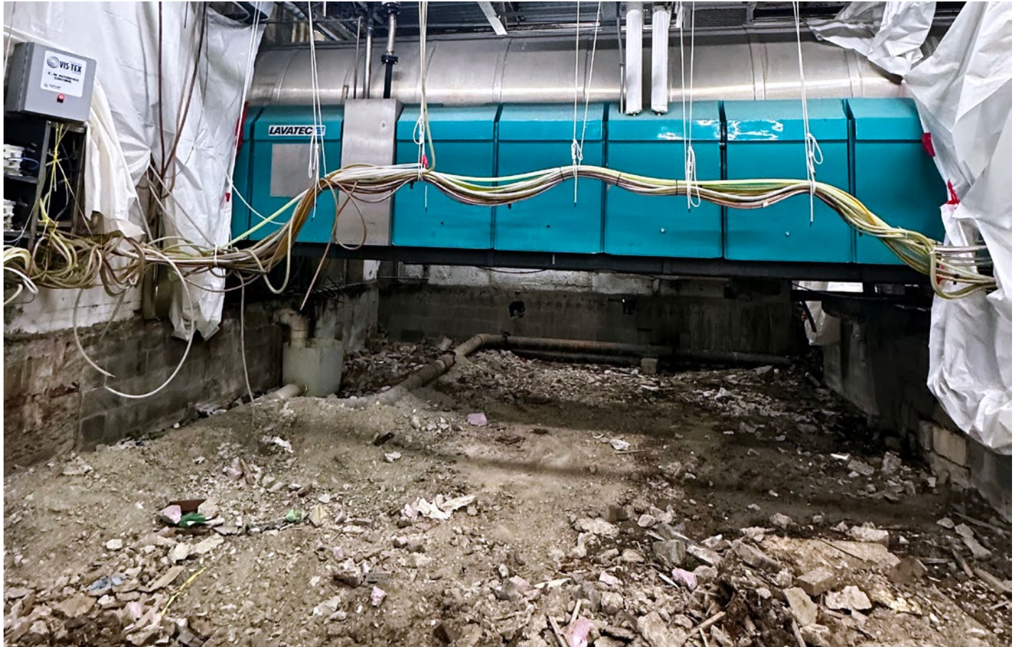
When repairs were needed, Bates Troy officials got creative and continued operating the LAVATEC tunnel washing system uninterrupted by suspending it above the wash room floor.

Bates Troy earned its TRSA Hygienically Clean certification in 2022. Kradjian said the key to their success in having their tunnel washer perform at such a high level for so many years is simple.