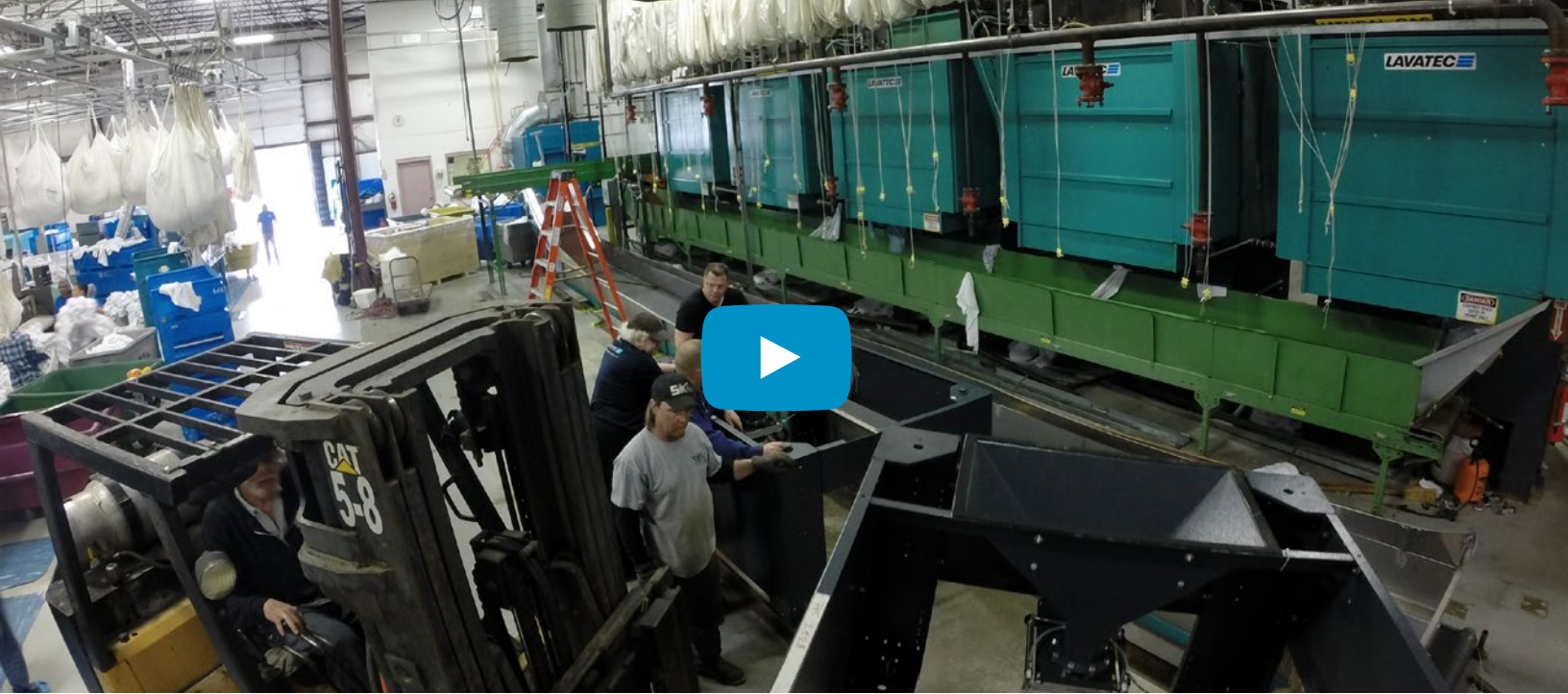
See time-lapse video of the “out-with-old, in-with-new” process for Sodexo and UC Health at Midwest Laundry, a brief film (2:41 min.) on maintaining service during a major renovation. Click the image or visit www.lltusa.com/customerstories .

It seems to be simpler with fewer moving parts than others and it works very well.”